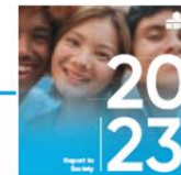
Report to Society